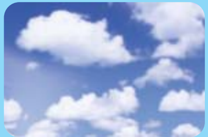
6. Window is left clean