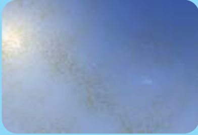
1. The window is exposed to daylight