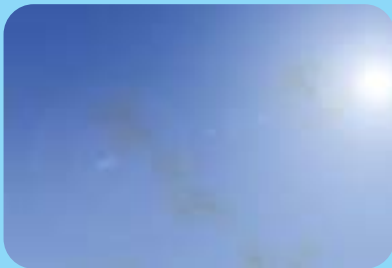
3. Reaction loosens organic dirt