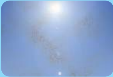
2. Daylight triggers the Pilkington Activ ™ coating