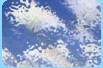
4. Rainwater hits window and sheets down glass