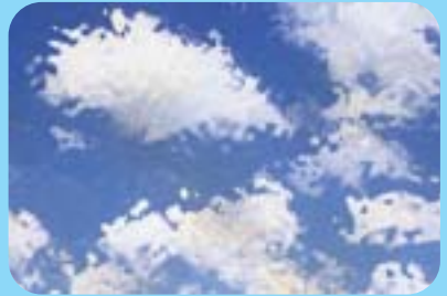
5. Dirt is washed away by rain